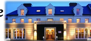
Redcastle & Spa Hotel

Redcastle oceanfront hotel in Co Donegal is a superb 4 star hotel nestled on the shores of Lough Foyle in Inishowen on its wild Atlantic coastline.