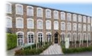
Blarney Woolen Mills Hotel

The hotel is built within the old stone walls of the historic mill and is steeped in history, rich in folklore and just 10 minutes from Cork.