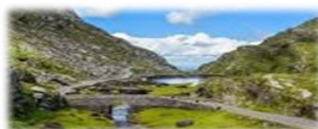
Killarney National Park