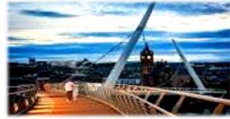
Peace Bridge, Derry

The White Horse Hotel is an elegant welcoming 4 star hotel. Including a 20 metre pool and newly refurbished luxury spa.